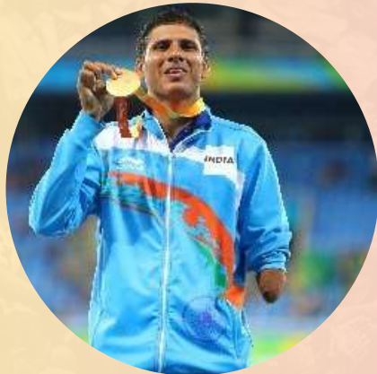
Sh. Devendra Jhajharia

Paralympic Gold Medalist, Padma Bhusan, Padma Shri, Major Dhyan Chand Khel Ratna Awardee, President, Paralympic Committee of India